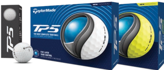
SOFTEST 5-LAYER TOUR BALL