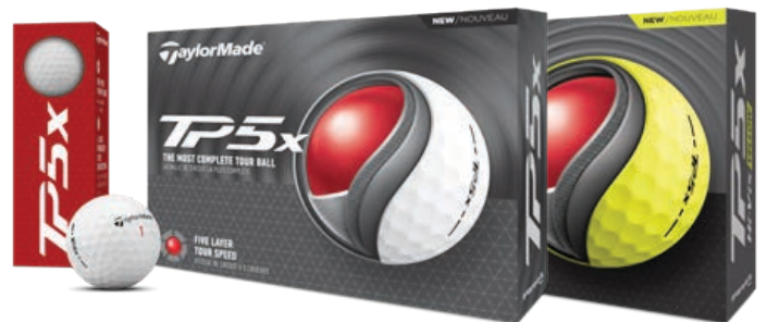
FASTEST 5-LAYER TOUR BALL